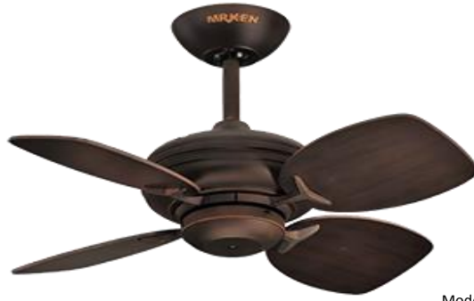
Model : MINI FAN