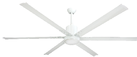
Model : HELICOPTER 84''/WH