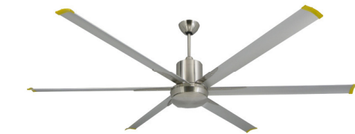
Model : HELICOPTER 84''/BN