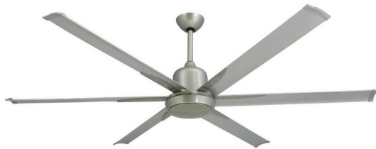
Model : HELICOPTER 84''/AP